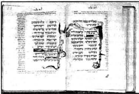
Psalm 61 — "For the Leader, with string music" — in the Palatina Library manuscript

Further details are obtainable from the publishers at 40 Hamilton Terrace, London NW8 9UJ.